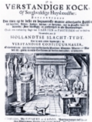
The cover of the original De Verstandige Kock (1683) reprinted from The Sensible Cook (1989) .

Taert(en) - a collective noun, indicating a baked good made from a short-crust dough containing a variety of mostly sweet, but sometimes savory fillings, resembling a tart, flan, patty, pie or pastry.